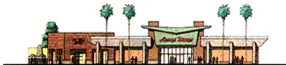
Artist's rendering shows a Longs Drugs planned for a South Highway 101 property in Solana Beach. Courtesy of Mike Orlando